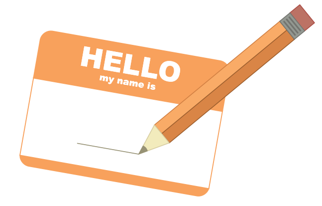
Source: Kosciw, et al. "The 2015 National School Climate Survey: The experiences of lesbian, gay, bisexual, transgender, and queer youth in our nation's schools." 2016. GLSEN.

50% OF TRANSGENDER STUDENTS WERE UNABLE TO USE THE NAME OR PRONOUN THAT MATCHED THEIR GENDER