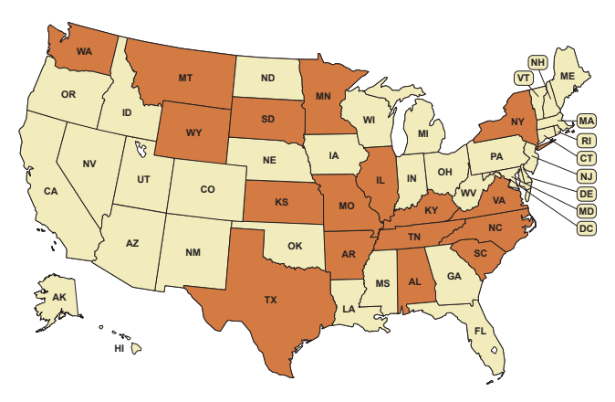
Figure 2: Bills Introduced in 2017 to Limit Transgender Students' Access to School Facilities

Although the text of the bills varies from state to state, they each include many of the same essential specifications. These include definitions of "sex" or "biological sex" ranging from "the physical condition of being male or female, which is stated on a person's birth certificate" (in New York)<sup>28</sup> to "the physical condition of being male or female, which is determined by a person's chromosomes and is identified at birth by a person's anatomy" (in Minnesota).<sup>29</sup> These definitions of sex are all designed to have the same result: relegate transgender students to facilities that do not align with the gender they live every day.